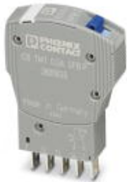
Thermomagnetic device circuit breaker, 1-pos., tripping characteristic SFB, 1 PDT contact, plug for base element.

Please be informed that the data shown in this PDF Document is generated from our Online Catalog. Please find the complete data in the user's documentation. Our General Terms of Use for Downloads are valid ( http://download.phoenixcontact.com )